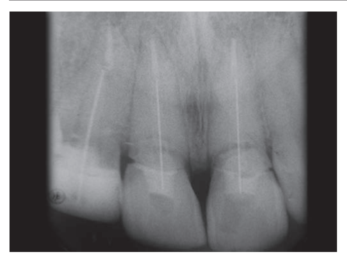
Fig. 5: Post luted to the canal using a self-adhesive resin cement

instruction regarding preventing loading of the anterior teeth was given to the patient. Periodic recall was done after 1, 3, 6 months, and 1 year after the trauma; the patient showed no periodontal or periapical pathology. The teeth were found to be functional and esthetically acceptable.