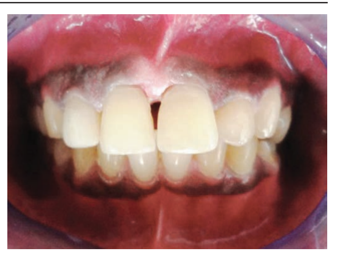
Fig. 6: Properly finished margins

Self-adhesive cements were used to lute the post to the canal. Radovic et al have reported that the adhesion between the post and the root canal walls showed better adhesion to root canal dentin with self-adhesive cement. Debonding and root fracture are the most common complication of post and core system. The rigid cast metal post causes wedging forces on the teeth and may