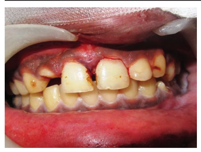
Fig. 1: Fracture in the cervical third region of 11, 21, and 12 with pulp exposure